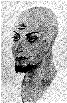
E YADA DI SHI'ITE

This personality was born in the city of Kaoti (City of Temples) in a civilization called Yuga (Vast Body), or Yu. This civilization consisted of 180 million people and existed a half million years ago. It was located in the Himalayan Mountains. He was taken from his mother as a baby and raised in the temples, to become a Kata (Priest) and later High Priest or Yada. The word really means "Spirit Life": He was therefore one of the heads of a mystical order called "Shi Ite".